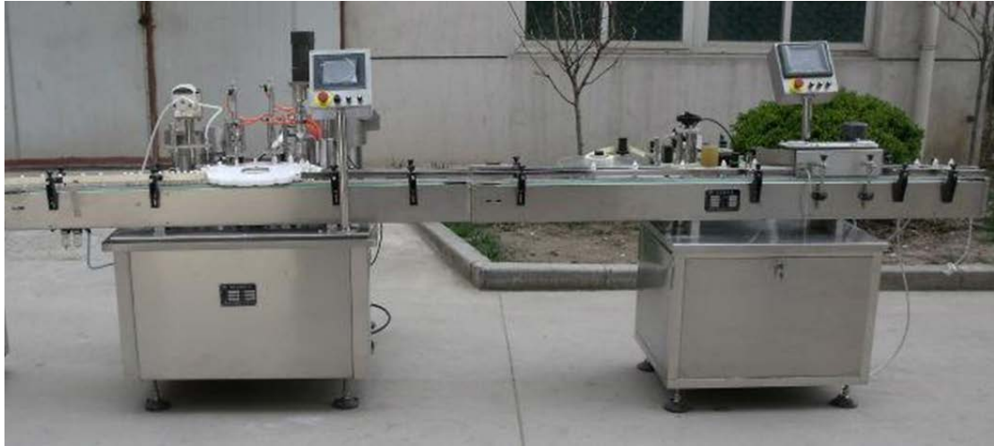
Automatic filling and capping machine